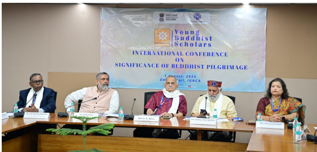
Dignitaries during the inaugural session

The International Buddhist Confederation (IBC) organized one day International Conference of Young Scholars on the theme 'Significance of Buddhist Pilgrimage' on 1 st August, 2023 at Umang Hall, IGNCA, Janpath, New Delhi. The Conference aimed to create a vibrant platform for young researchers to share their insights, engage in scholarly pursuits and contribute to the advancement of knowledge in the field of Buddhist Pilgrimage. As many as 16 young scholars from various countries such as Cambodia, Iran, Laos, Myanmar, Netherlands, Thailand and Vietnam who are based in India and studying Buddhism related subjects presented their papers during this Conference. Young scholars from different Indian universities also participated in the Conference.