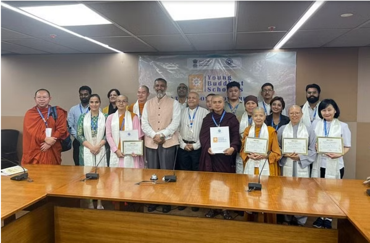
The conference saw attendance of over 70 scholars of different nationalities

New Delhi [India], August 2 (ANI): The international conference of young Buddhist scholars on 'Significance of Buddhist Pilgrimage' brought together young academicians and researchers who discussed diverse dimensions of Buddhist pilgrimage as seen by the youth today.