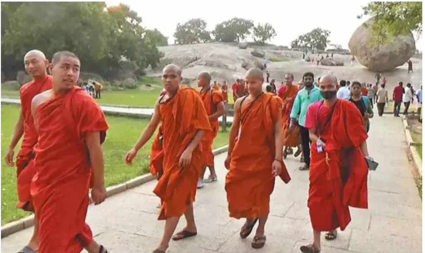
Representative Image

NEW DELHI: An inspiring international conference of young Buddhist scholars was successfully organised in Delhi by the International