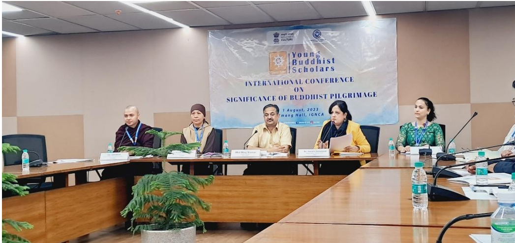
First Technical Session