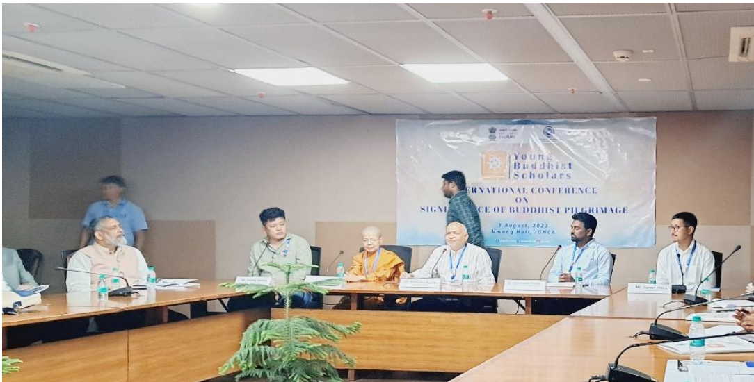
Second Technical Session

women's spiritual journeys and their contributions to Buddha Dhamma. The paper emphasized the significance of promoting gender equality in the practice of Buddhist Pilgrimage.